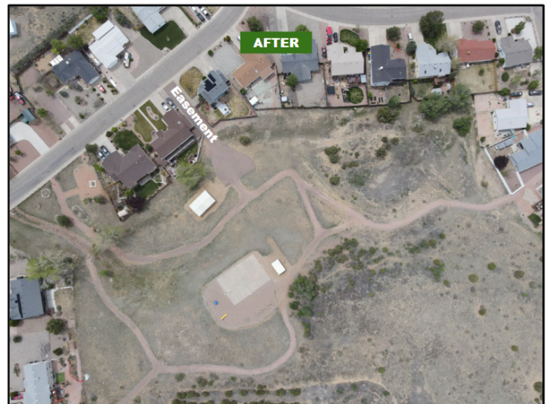
Aerial image of the park. Shows the improved easement and the trail. We were able to add road base to the entire trail.