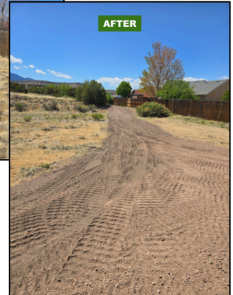
Looking down the easement that leads to the park